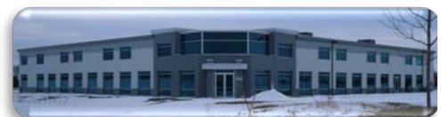
Estimated Completion – Spring 2010

"We had our first surgeon design review concerning the pedicle screw instruments a couple of days ago. I am happy to say that everyone was really impressed with your instruments (more so than your competitors' instruments...). Based on our recent meeting, I would like for Bradshaw to develop most of the instruments for our pedicle screw system. You have been very responsive to work with so far, which is greatly appreciated it." -Major Spinal Company/ Vice President, Product Development